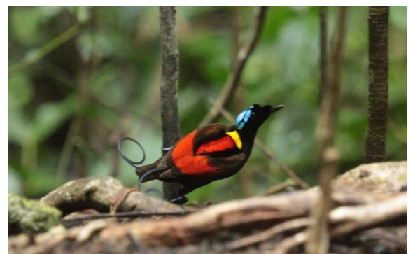
From top: Pantropical Spotted Dolphins Raja Ampat island & Wilson's Bird-of-Paradise.