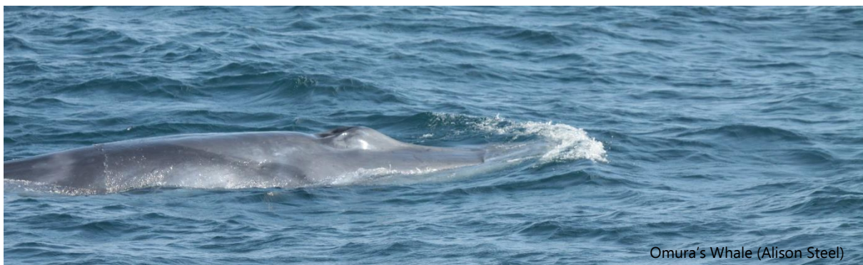
Omura's Whale

To start off with we will head out of the Lembeh Strait, then head across the Molucca Sea towards the west coast of Halmahera. This wide, deep channel is used by migrating whales, so we will keep an eye out for whales and dolphins during the crossing. Pulau Tifore lies roughly half way across, so we will break the journey with some snorkelling here. The reefs are known for their schools of fish and, in particular, barracuda are often found here.