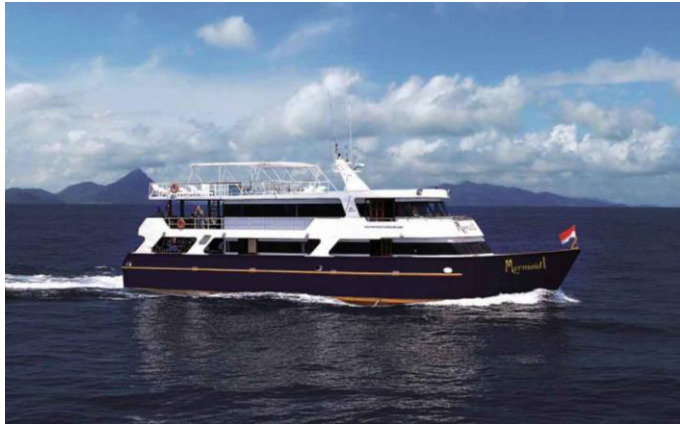
MV Mermaid I

Master Suite – one suite with one double bed and panoramic windows looking forward over the bows, for an extra £495 per person.